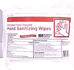
4 - 800 count Bulk Hand Sanitizing Wipes and Floor Stand Dispenser