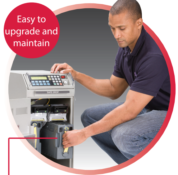
Locking or non-locking 1200-note cassettes

Each CacheSystem includes a thorough user manual and a "Quick Reference Guide" to get you started. Individual or group training classes are available. Every customer receives free 24/7 phone support for the lifetime of their safe.