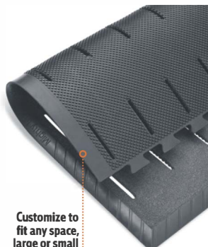
Customize to fit any space, large or small

STYLE | 46 Mid-Section Dimensions 3'x3' Thickness 9.5 mm Weight 24 lb.